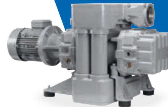
GMa 13.7 HV/BP

The bypass valve allows to start the Roots pump at the same time as the backing pump, protecting the Roots pump from any operation at high overpressure.