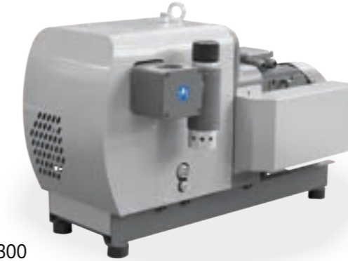
DRY C 300

Suction filter Vacuum regulating valve Safety valve Silencer