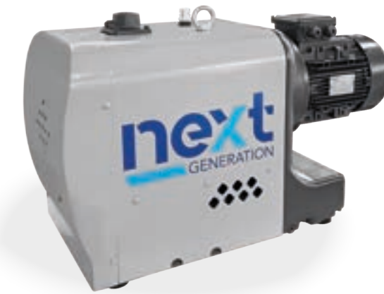
DRY C 157